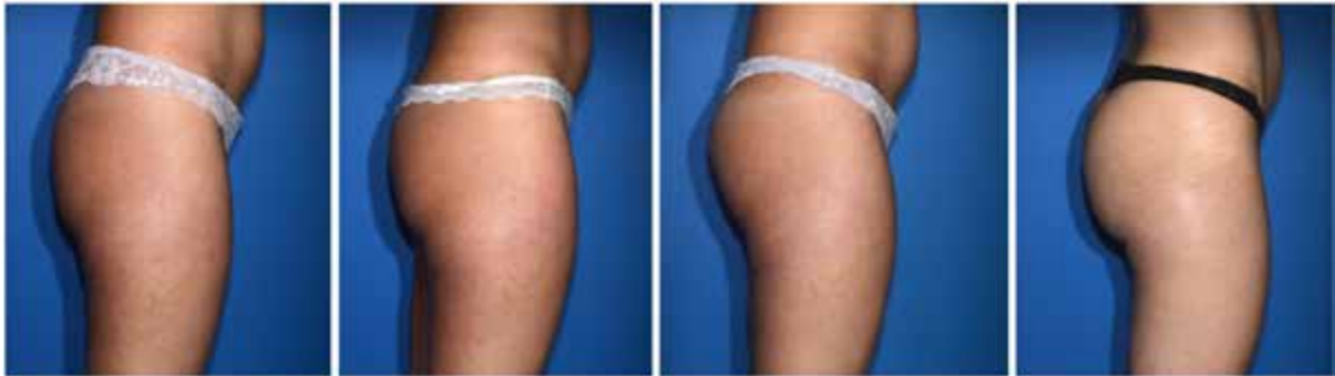
Figure 1: Digital photographs of subject ID 6 taken at baseline (left), after the 4th treatment (middle left), during the one-month follow-up (middle right) and three-month follow-up (right). The photographs illustrate gradual progress in the shape of the buttocks.