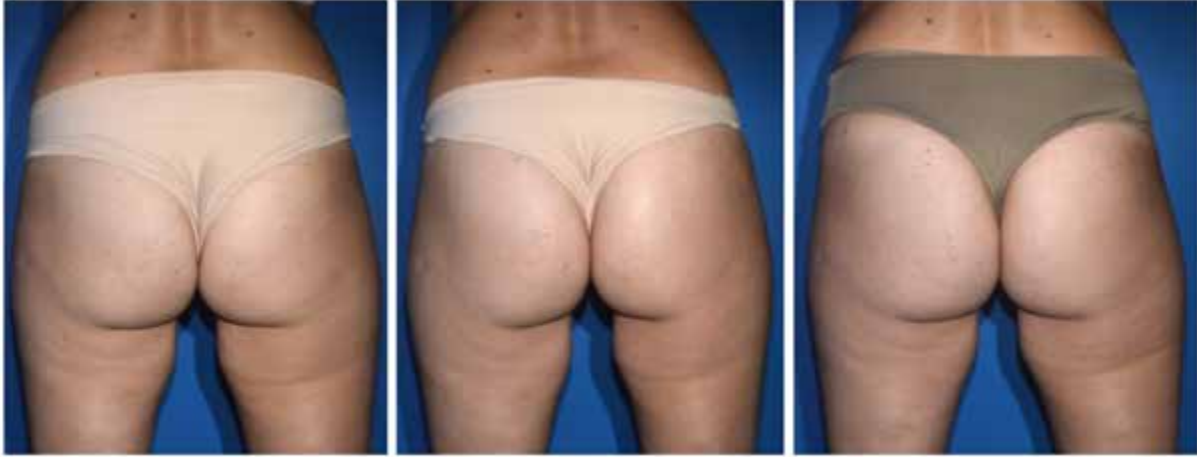
Figure 3: Photographs of a 25-year-old female (Subject ID 7) taken at baseline (left), after the 4th treatment (middle) and after 3 months (right).

photos is lifted, firmer and gives the impression of fuller look. In addition, a slight volumetric enhancement can be seen in the 3-month photograph.